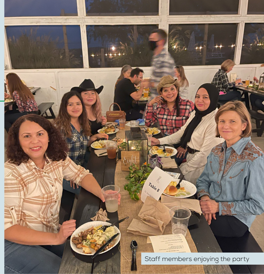
Staff members enjoying the party

After the long early months of the COVID-19 pandemic, we were thrilled to be able to return to holding our annual fundraising dinner in person in the fall of 2021. Boots, Beer, & BBQ is a favorite autumn event when supporters, Board members, staff, and volunteers celebrate Loudoun Free Clinic's mission together, and raise funds for our work going forward. The evening included a special Thank You to the Claude Moore Charitable Foundation for their investment in a renovation project that ultimately upgraded and expanded the capacity of our clinic over the next year. We also unveiled the Clinic's new logo—designed to represent our goal of providing healthcare across a diverse spectrum of people and needs. The new logo also depicts the care and community connection that patients experience. We are so grateful to everyone who came out to support us and made this an evening to remember!