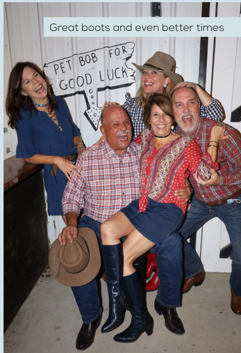
Great boots and even better times